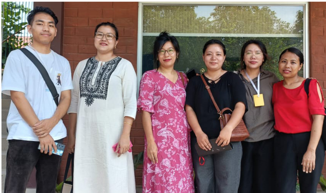
VBS teacher's training

We thank God for His presence throughout the training and express our sincere appreciation to all the resource persons, organizers, and participants. Let us continue to pray for the upcoming VBS, that many young