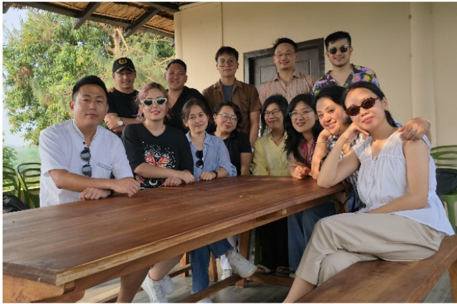
Potluck picnic fellowship organized at Atoqa Tea Factory, Nikheku Village

We earnestly wait for His teachings and purposes fulfilled for the rest of the year. Keep us in your prayers.