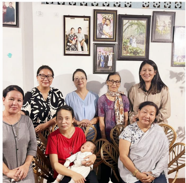
2nd executive meeting of the Dimapur Baptist Women's Union held at CBCD