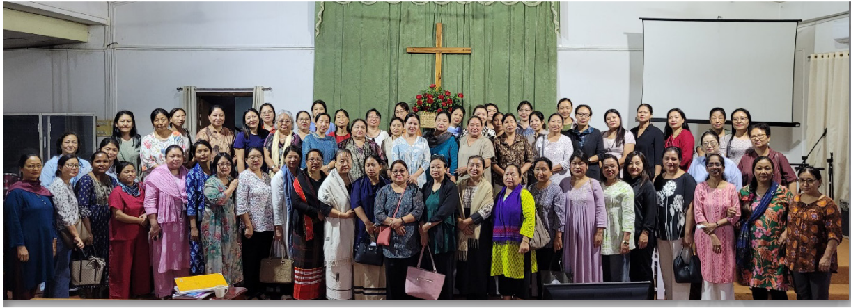
2nd executive meeting of the Dimapur Baptist Women's Union held at CBCD