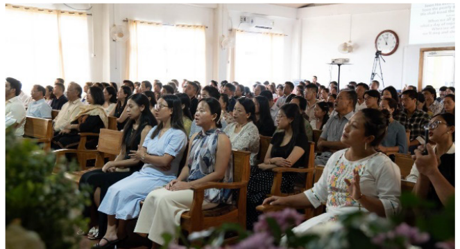
Glimpses of CBCD Hymn Sunday