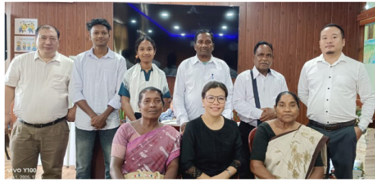
Gospel Retreat with Harishpur Baptist Fellowship Namrup at CBCD

On the 1 st of June, the visiting members presented a special song during the Sunday devotional service.