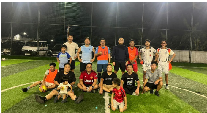
MPB Futsal at Arena 365

The Men's group led the Sunday service praise and worship on the 22 nd of June and also participated in the Church's hymnal Sunday on the 29 th of June.