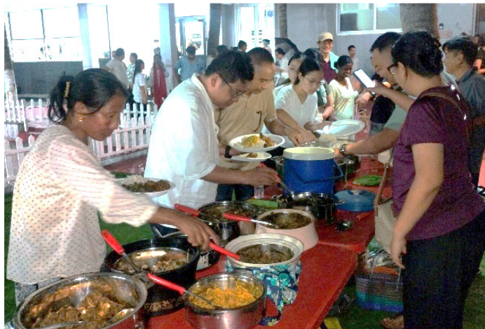
Snapshots of Member Care Fellowship at Arena 365