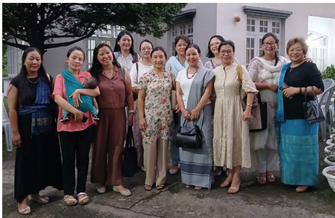
At the one-day retreat organised by the DBWU

Join us for our women's fellowship where we can share, encourage and uplift one another in the spirit of love and community. We have our monthly fellowship on 2nd Saturdays of every month at 4pm. Stay updated for other activities like retreat, outreach, events and gatherings.