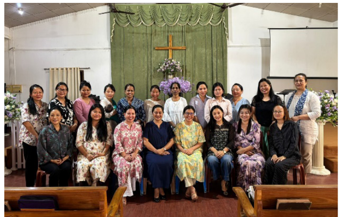
CBCD Women's one-day retreat