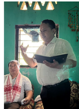
Snapshots from the visit to Assam mission field

The Committee expresses their profound gratitude for the Church's unwavering support across all aspects of our mission work. We pray the Lord continues to inspire us and use CBCD as a faithful instrument to serve those in need. All glory and honour be to our Living God for His abundant grace, mercy, and love.