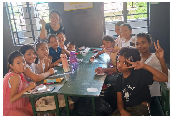
Snapshots of Sunday School classes