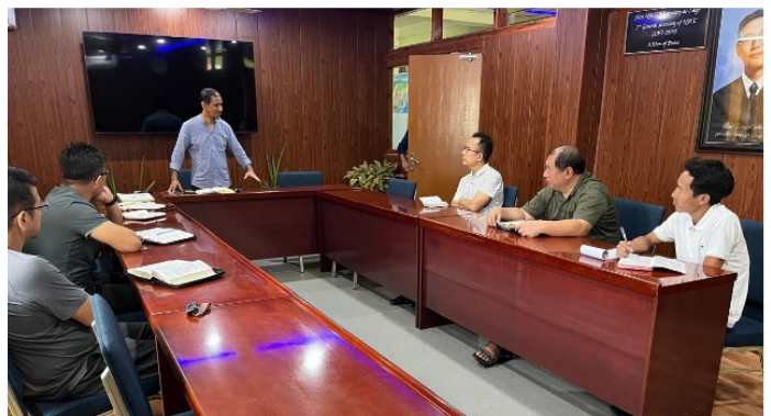
MPB Bible Study at NMM Conference Hall