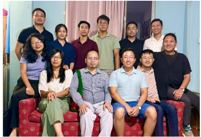
CBCD Crossover monthly Fellowship meeting