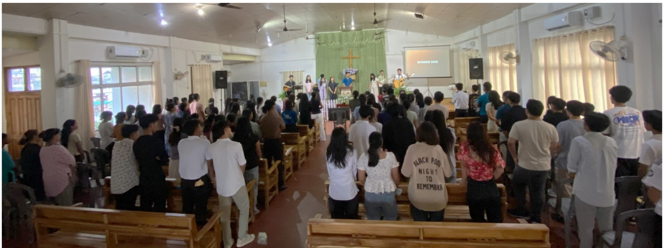
Glimpses from the Youth Express Evangelistic week from held June 6th to 8th