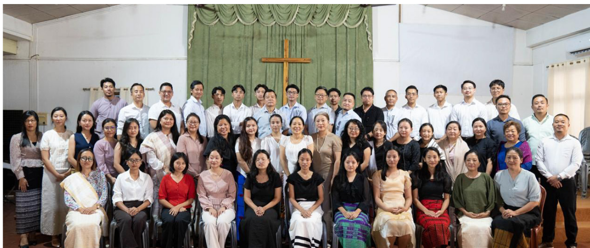
Covenant Baptist Church Dimapur Choir

What is YOUR redemption story? Many hymns emerged from a personal story of encounter with God. Some in despair, some during seemingly irreparable loss and tragedy, some out of deep conviction, and some out of overflowing joy of the gift of salvation. Through it all, it was a very personal choice to choose and love God above all situations and circumstances. This redemption love story resonated in the hearts and minds of the congregation as the Sunday wrapped up with a blessing over each other - the sevenfold Amen (Peter Christian Lutkin, 1900). We prayerfully look forward to many more Hymn Sunday celebrations at Covenant Baptist Church, Dimapur. Amen.