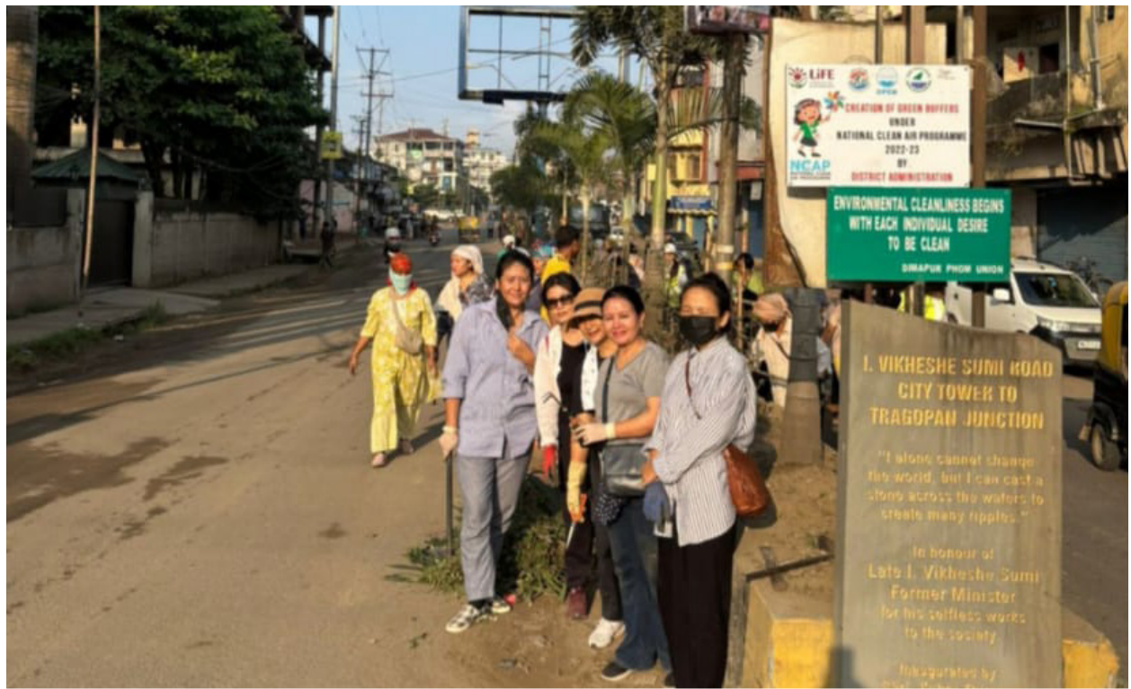
Combine social work with DBWU ,Team Better Dimapur and Tenyimi Students Union