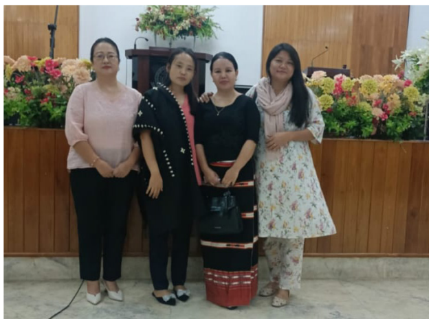
Home visitation and attending DBWU combined service at Lhomithi Baptist Church