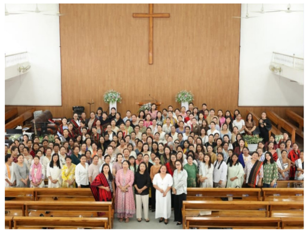
Attending a seminar at Yimkhuing Baptist Church, Dimapur