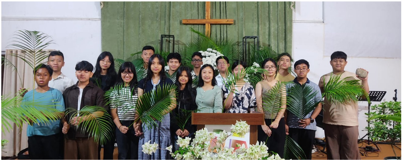
Teens Class: Special Presentation on Palm Sunday