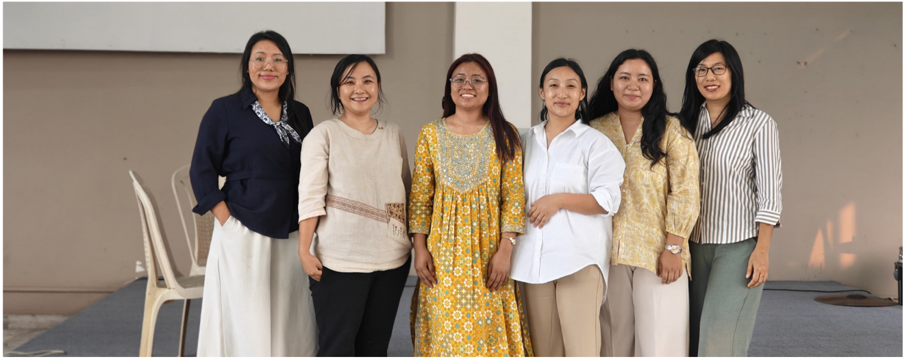
CBCD Teachers Training