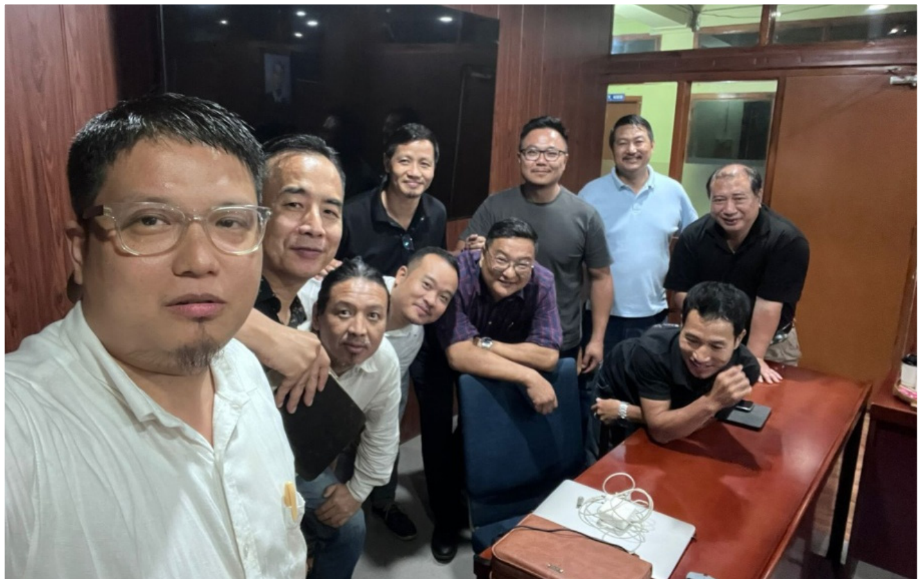
Selfie after a blessed fellowship