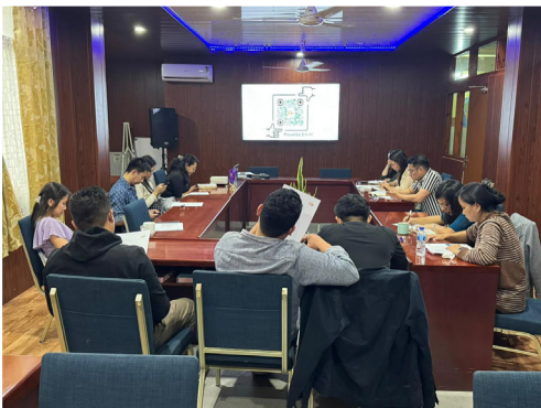
March Bible Study